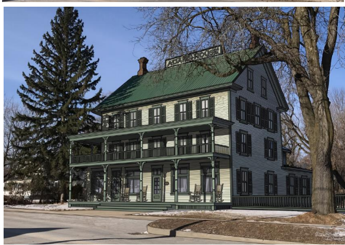
6 South River Street (Former Riviere Hotel)

development of a Story map to serve as a communication tool for the community of Swanton to review project information as it becomes available. Further details on the Swanton Northern Gateway Area Wide Plan can be found online: