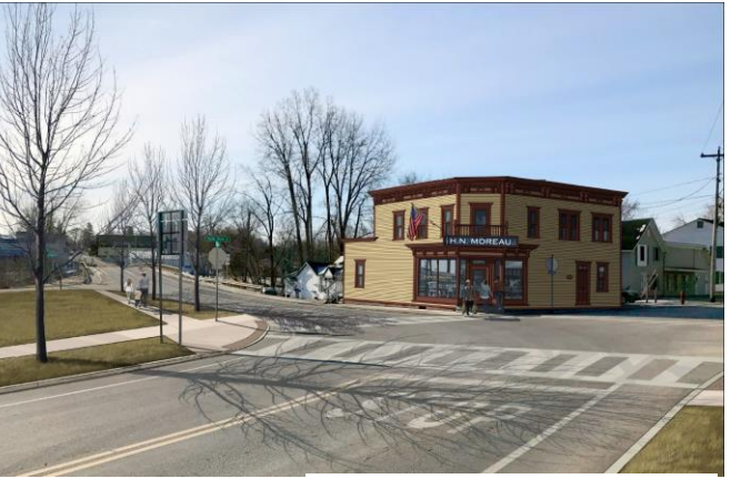
3 Depot Street (Moreau Building)