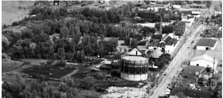
453 Pine Street and surroundings, 1953.

Cascade, Platform, Pace Analytical, Eurofins, GeoDesign, Weston & Sampson Engineers, Button Surveying, Arrowwood Environmental, US Ecology