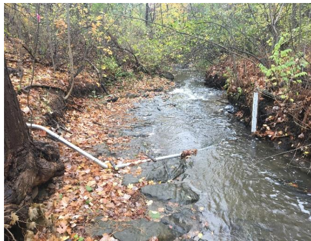
Left: Streamflow gauging station on Sunderland Brook, Colchester, VT. Right: Monitoring station on Centennial Brook.